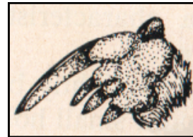
Echidna hind foot

A group of holes dug in soil with a distinctive narrow cylindrical end, is clear evidence of one of these unique egg-laying mammals. Their cylindrical droppings full of ants may also be found in the area. Careful examination of soft soil may reveal their tracks.