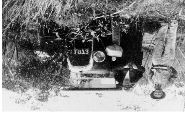
Winifred Warnes and Horrie Truscott at Gluepot about 1938 with Reg Warnes' 1934 Fiat 501

Birdlife Australia Gluepot Reserve contact details: gluepot@gluepot.org www.gluepot.org 08 8892 8600