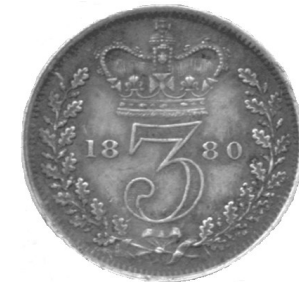
Threepence found near the Old Gluepot Dam.

Established with the support of the South Australian Government through the History Trust