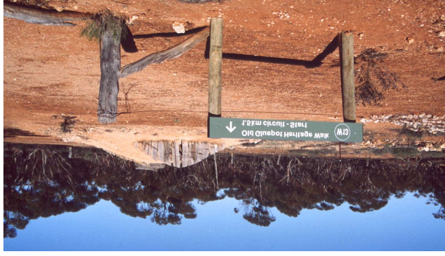
The remains of the Old Gluepot Homestead - the underground room can be seen in the background.