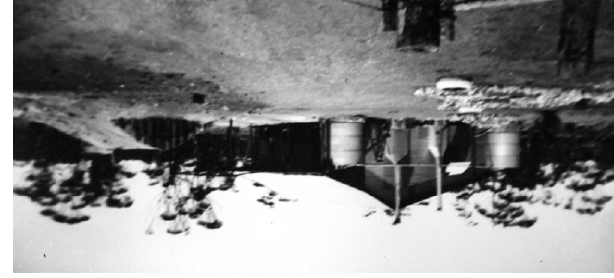
Gluepot Homestead in about 1939

Birdlife Australia Gluepot Reserve contact details: gluepot@gluepot.org www.gluepot.org 08 8892 8600