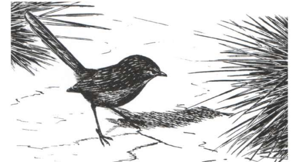
Striated Grasswren Amytornis striatus