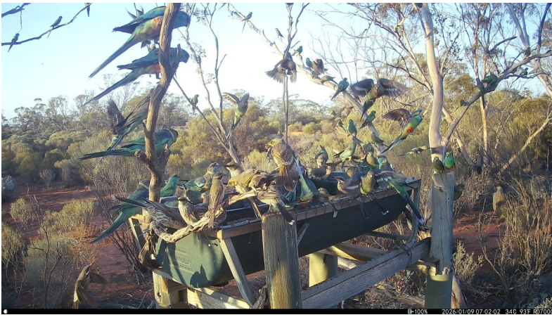
47deg.C The water is a lifesaver.