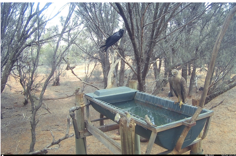
A Brown Goshawk thinking about its next meal?