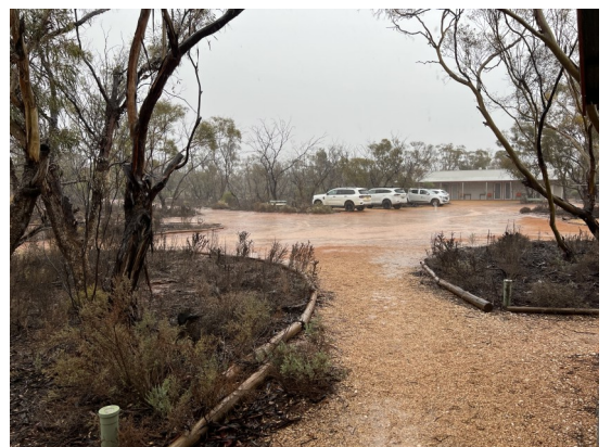
It really does rain at Gluepot.....sometimes