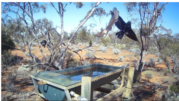
A Corvid (on Left) and Willie Wagtail (on Right) harassing Brown Goshawks.