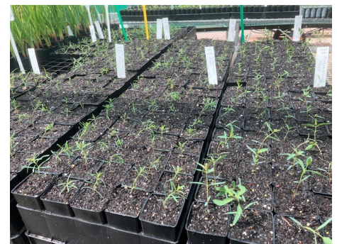
The seedlings

They have been planted and are being cared for at the Trees for Life Nursery (pictured on Right).