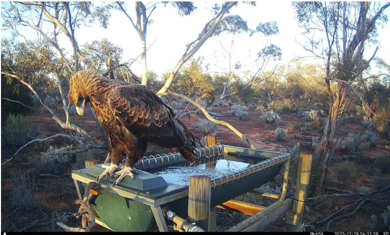
Wedge-tailed Eagle. An unusual visitor.