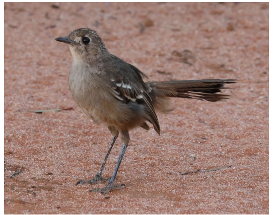
A Southern Scrub-robin